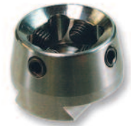
HAD-SPR HAD-SPR-AP HAD-SPR-P Sliding Pyramid Receiver