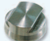
HAD-RSA HAD-RSA-AP HAD-RSA-P Rotating Slide Adapter