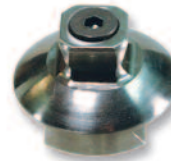
HAD-SP HAD-SP-AP HAD-SP-P Sliding Pyramid