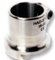
HAD-STCA HAD-STCA-AP HAD-STCA-P Sliding Tube Clamp Adapter