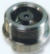
HAD-SRTA* HAD-SRTA-AP* HAD-SRTA-P* Sliding Rotating Threaded Adapter