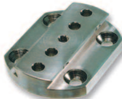
HAD-4HPU HAD-4HPU-AP HAD-4HPU-P Sliding 4-Hole Plate (unthreaded)