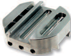
HAD-CC HAD-CC-P HAD-CC-P Central Core - Foundation for attachment of all other modules