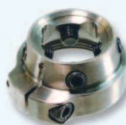
HAD-TPR HAD-TPR HAD-TPR-P Threaded Pyramid Receiver

*MUST BE USED WITH EITHER HAD-TP OR HAD-TPR