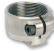
None HAD-TFD-AP HAD-TFD-P Threaded Female Dovetail

*MUST BE USED WITH EITHER HAD-TP OR HAD-TPR