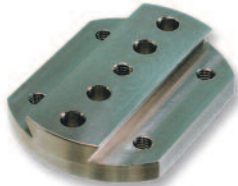
HAD-4HPT HAD-4HPT-AP HAD-4HPT-P Sliding 4-Hole Plate (threaded)