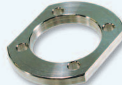
HAD-RHP* HAD-RHP* HAD-RHP-P* Rotating Housing Plate