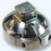
HAD-TP HAD-TP HAD-TP-P Threaded Pyramid